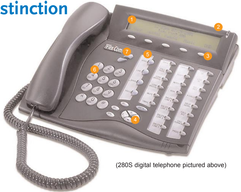
(280S digital telephone pictured above)

Available in your choice of pearl white or charcoal grey, all Coral FlexSets come with four buttons configured system-wide for consistent operation. A system administrator or individual users can define remaining buttons as needed.