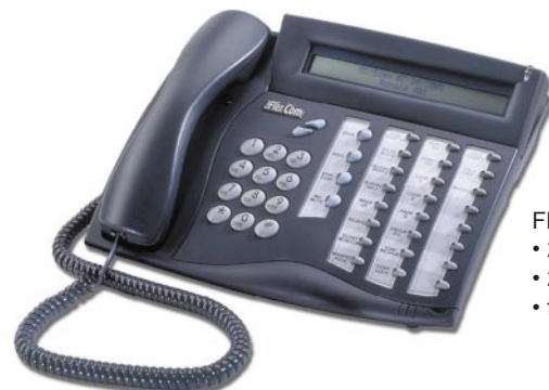
FlexSet 280D • 28 buttons • 2 x 40 LCD • full speakerphone