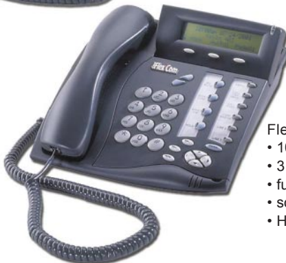
FlexSet 120S • 10 buttons • 3 x 24 LCD • full speakerphone • soft-key operation • HDF support