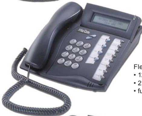
FlexSet 120D • 12 buttons • 2 x 24 LCD • full speakerphone